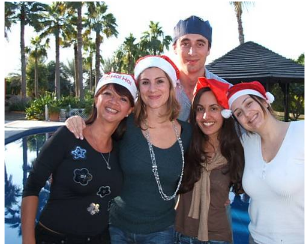
The Trench & Associates team enjoying their Christmas Party, December 2007

For further information on Trench & Associates please visit www.trenchlaw.com , or e-mail the firm; coordinator@trenchlaw.com .